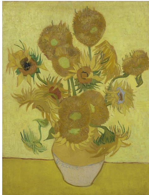
Vincent Van Gogh